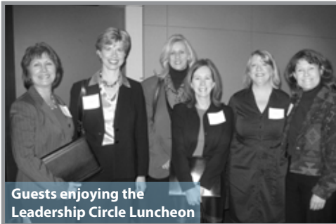
Guests enjoying the Leadership Circle Luncheon

The annual Lifeworks Leadership Circle Luncheon was held Thursday, February 7 in the Jackson Room of the Travelers Building in St. Paul. More than 100 Lifeworks supporters, clients, board members, and staff gathered to celebrate the organization and recognize the generosity of its benefactors, whose gifts totaled $704,265 for the year 2007.